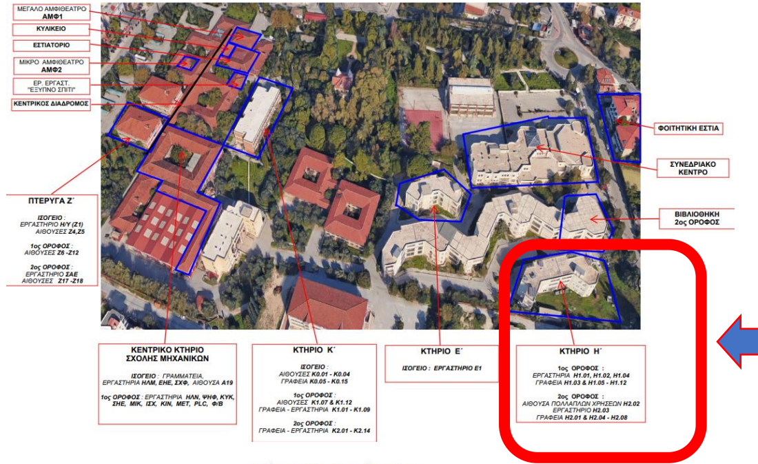
Κτήριο Η' - 2ος όροφος

ΠΑΝΕΠΙΣΤΗΜΙΟ ΠΕΛΟΠΟΝΝΗΣΟΥ - ΣΧΟΛΗ ΜΗΧΑΝΙΚΩΝ (ΠΑΤΡΑ) ΤΜΗΜΑ ΗΛΕΚΤΡΟΛΟΓΩΝ ΜΗΧΑΝΙΚΩΝ ΚΑΙ ΜΗΧΑΝΙΚΩΝ ΥΠΟΛΟΓΙΣΤΩΝ